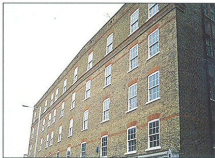
Client: Alan Selby & Partners. Contractor: Halstead Contracts Ltd.