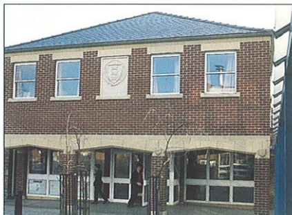
Client: The Boston Boys Grammar School, Boston. Contractor: Capitol Windows, Skegness.