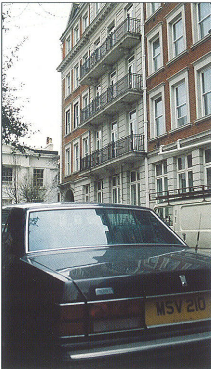
Client: The Rembrandt Hotel, London SW7 Contractor: Firmcool Ltd. T/A Silverglazed.