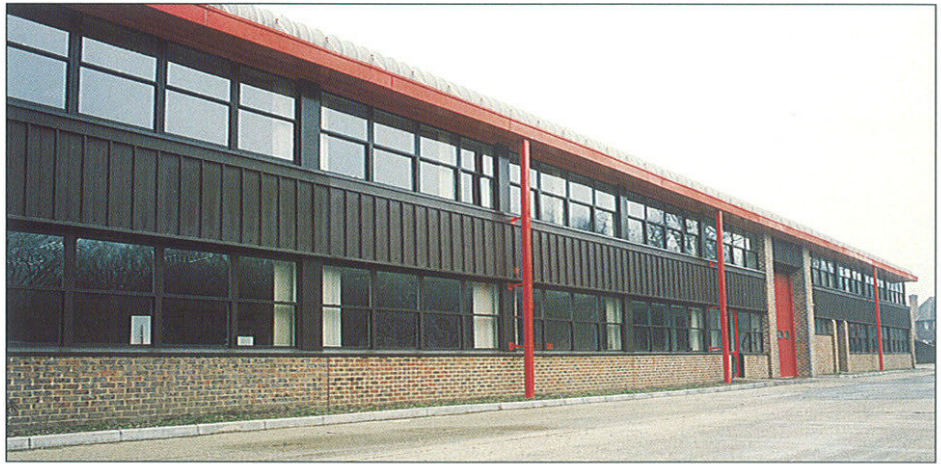
Client: FC Brown (Steel Equipment) Ltd., Bisley. Contractor: SPA Windows Ltd., South Norwood.

Its slim, elegant profile is favoured by architects and planners as a suitable replacement for the traditional box sash window for sensitive conservation areas.